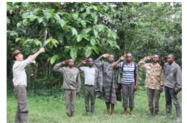
Onward into 2017!