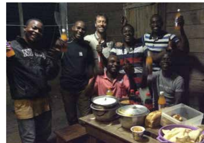
The Triangle team toast the New Year.