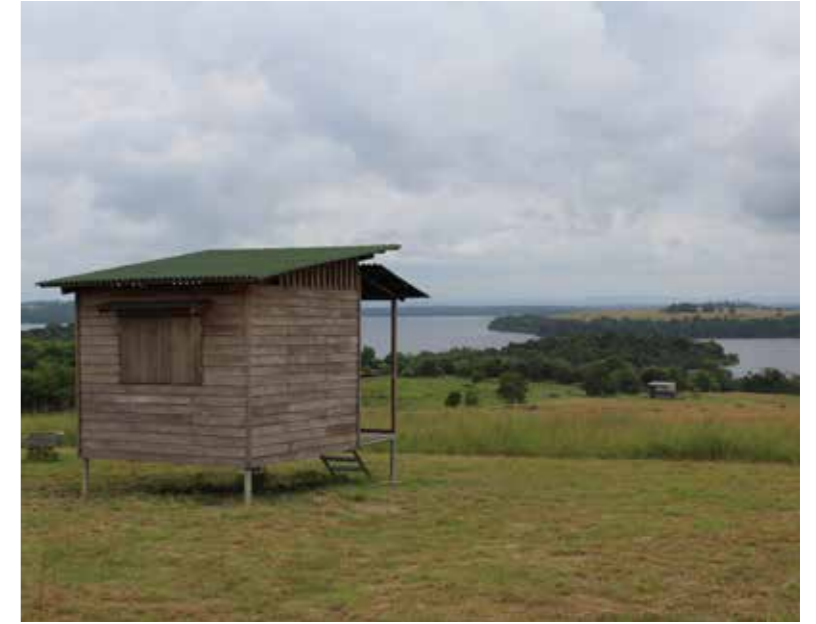
A new terrace for the house and three new bungalows on the hill.